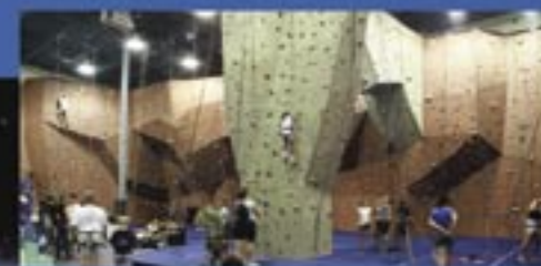
Summit Climbing Gym Grapevine, TX