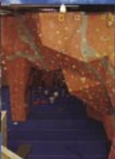
AZ on the Rocks Scottsdale, AZ