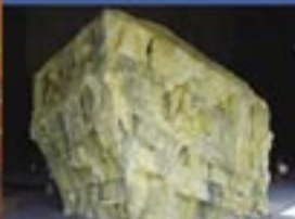
Canyons Climbing Gym Frisco, TX