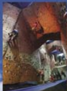
Upper Limits St. Louis, MO